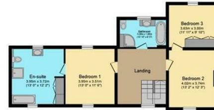
First Floor Floor area 76.6 sq.m. (824 sq.ft.)