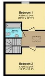
Annex First Floor Floor area 38.1 sq.m. (410 sq.ft.)