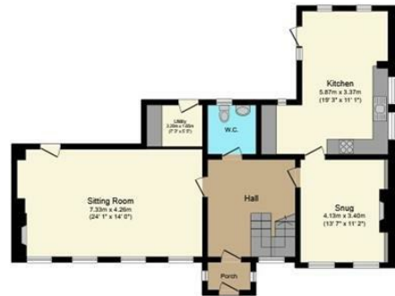
Ground Floor Floor area 94.5 sq.m. (1,018 sq.ft.)