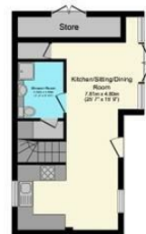
Annex Ground Floor Floor area 35.4 sq.m. (381 sq.ft.)