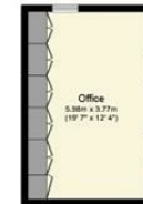
Outbuilding Floor area 22.5 sq.m. (243 sq.ft.)